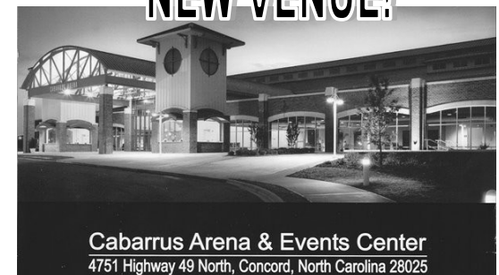
Cabarrus Arena & Events Center 4751 Highway 49 North, Concord, North Carolina 28025